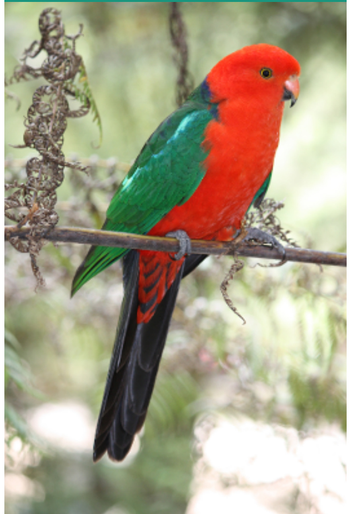
"King Parrot" taken in Badger Creek, Victoria.